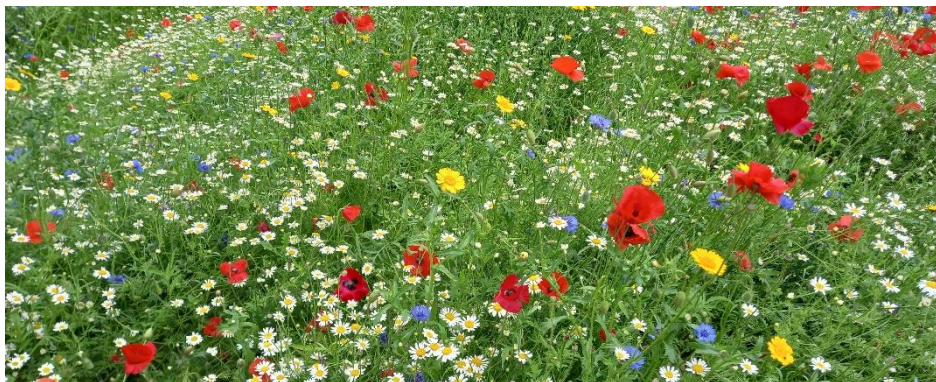
Wonderful Wild Flower Display in Barby

Proceeds to be split between HMP Onley Mental Health Outdoor Gym and Onley Park Residents Community fund (to put on future events)