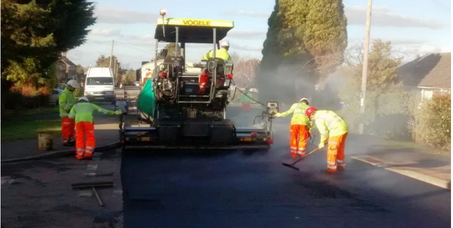
Highway Repairs Daventry Road