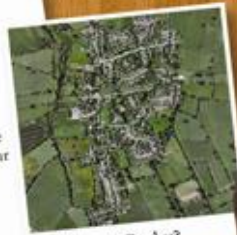
Selling in Barby?