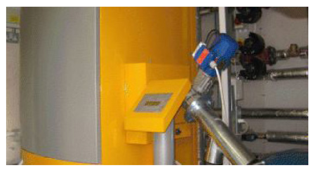
Efficient: A wood pellet boiler

St Paul's church is a Grade II listed building in the leafy parish of Gulworthy Cross, Devon, which is located in the Tamar Valley Area of Outstanding Natural Beauty. Between April and November 2008, the church replaced its worn-out storage and radiant heaters with a new radiator system coupled with a 50kW wood pellet biomass boiler standing in a 'pod' outside of the church.